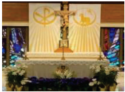
SANCTUARY LAMP +D'SOUZA & NOONAN FAMILIES