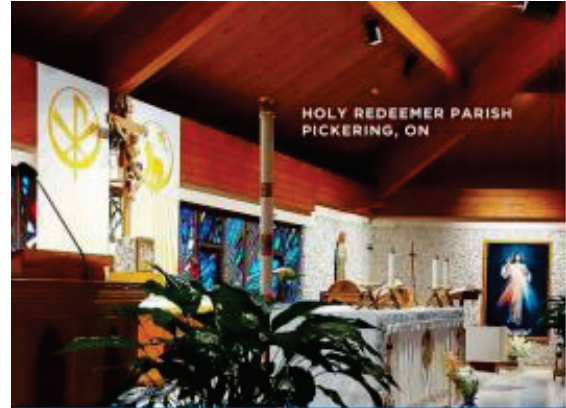
HOLY REDEEMER PARISH PICKERING, ON

REGISTER OR VOLUNTEER FOR TOTUS TUUS AT OUR PARISH!