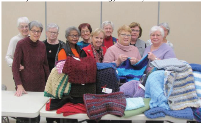
Photo of some PSM members and the gifts to Abbeylawn in December.

Through that generosity and the talents of the Ministers, both those at the bi-monthly meetings and those who make them at home, Holy Redeemer donated 17 Prayer Shawls and 38 Lap-Throws to the residents of Abbeylawn Retirement Residence (see their ad on the back of the bulletin) as the first of an annual "Christmas gift-giving" to a group in our parish. Wishing our parish family health and happiness in this New Year.